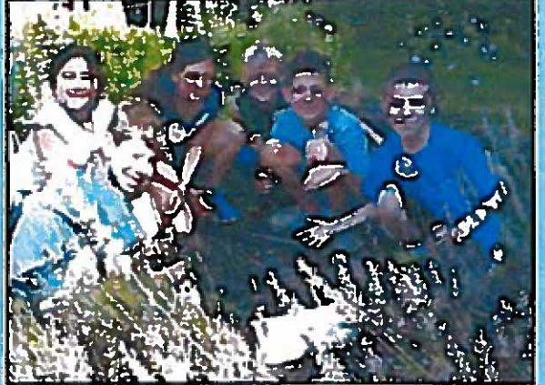
Tending to the kitchen herb garden on the historic Kissam property.